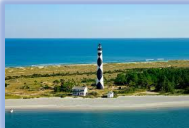
Cape Lookout - Excurion