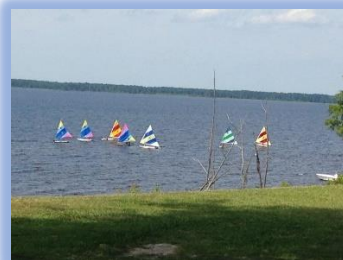
Small Boat Sailing - PSB

The Planning Process Due to the constantly changing conditions of the weather, your trip plan will not be finalized until you arrive and adjusted under way based on conditions. Your guide will sit down with your group to discuss the weather forecast for the week. The weather will be the major controlling factor during your trek. The guide will design your trip based on your group's interests and the weather. The physical safety of your group is paramount. Your group must be prepared for possible weather conditions that eliminate certain destinations.